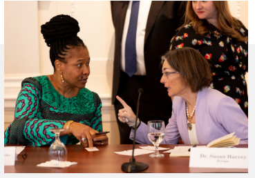
vital Relationships with U.S and global policymakers including international trade experts and foreign diplomats. Council members also engage with distinguished alumni of our international exchange programs which include nearly 200 Heads of State, such as New Zealand Prime Minister Jacinda Ardern, UN SecretaryGeneral Antonio Guterres and Indira Gandhi, among others.