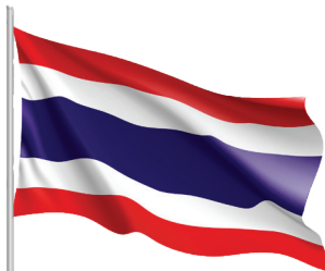
Royal Thai Embassy