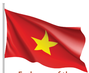
Embassy of the Socialist Republic of Vietnam