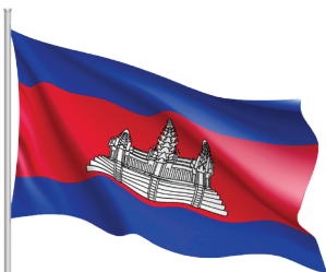
Royal Embassy of Cambodia