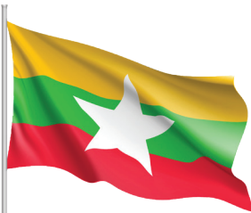
Embassy of the Republic of the Union of Myanmar