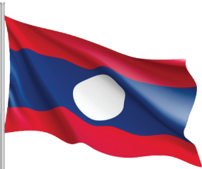
Embassy of the Lao People's Democratic Republic