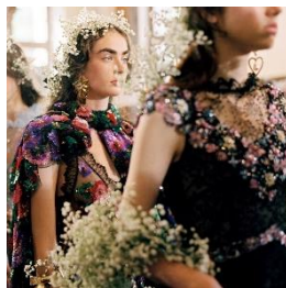
Rodarte, Spring/Summer 2018 backstage