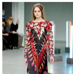
Rodarte, Fall/Winter 2013 runway