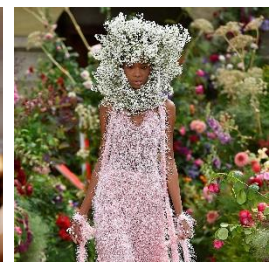
Rodarte, Spring/Summer 2018 runway