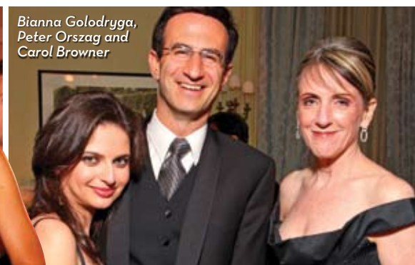
Bianna Golodryga, Peter Orszag and Carol Browner