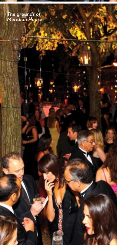
The grounds of Meridian House