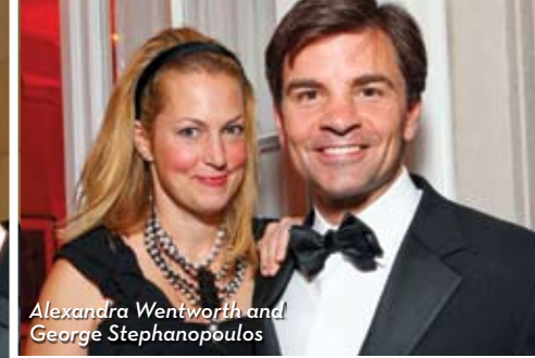
Alexandra Wentworth and George Stephanopoulos