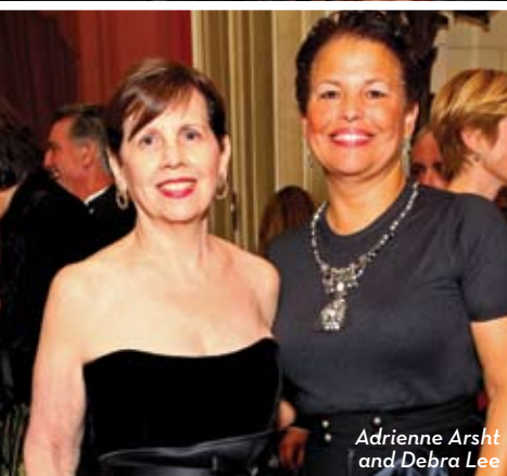
Adrienne Arsht and Debra Lee